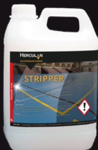
Stripper mixing ratio 1:100