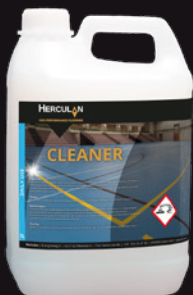
Cleaner mixing ratio 1:100