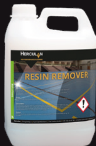
Resin Remover mixing ratio 0,8:100